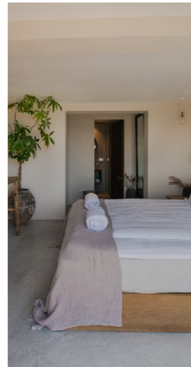
04 Huge double bedroom with en-suite bathroom and own large lounge terrace. Egyptian cotton sheets and towels.