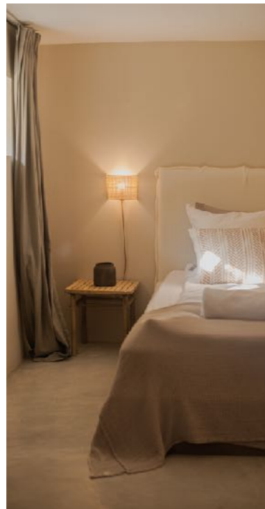
02 Double bedroom with en-suite bathroom, sea views and direct access to pool area. Egyptian cotton sheets and towels.