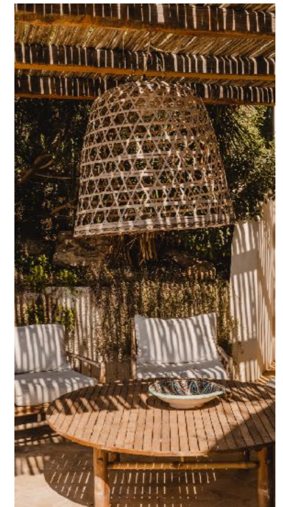
06 COCKTAIL CORNER

Large TV cinema room with 55-inch flat-screen TV on the pool level where you can take a break from the sun or enjoy cherished memories as you revel in captivating films.