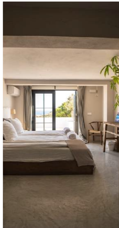
03 Double bedroom with en-suite bathroom, sea views and direct access to pool area. Egyptian cotton sheets and towels.