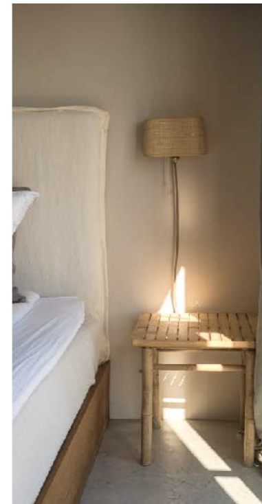
05 Double bedroom with bathroom, large TV room and direct access to pool area. Egyptian cotton sheets and towels.