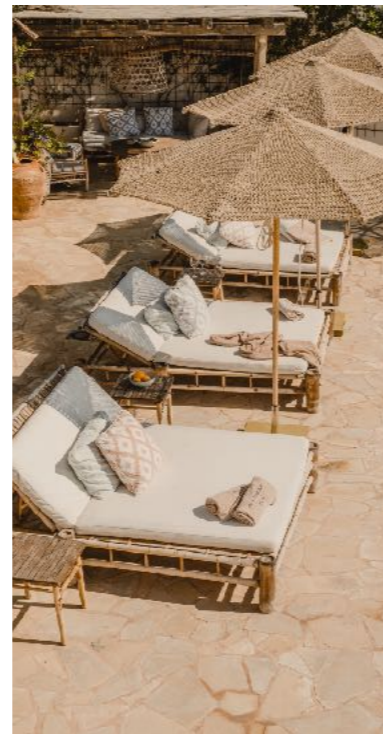
03 LOUNGE BEDS

Whether an early morning breakfast or an evening meal, the beauty of the main dining terrace is in the ever changing mediterranean sea and sunlight. Every meal, every experience, is unique and beautiful.