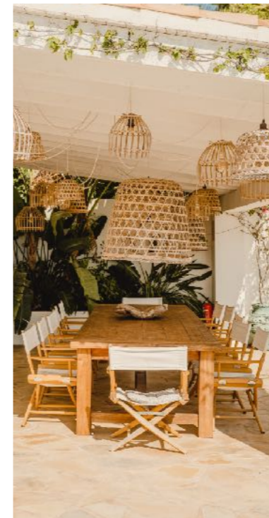
04 POOLSIDE DINING

There are single sun beds available on the spacious terrace by the pool, and in shaded areas for you to enjoy and relax.