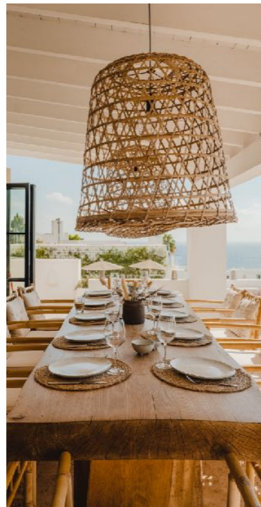
02 OUTSIDE DINING

The 10 x 5 m saltwater pool enjoys breathtaking views of the sea. The salt-water is kind to the eyes, skin and blond hair, and is maintained every day.