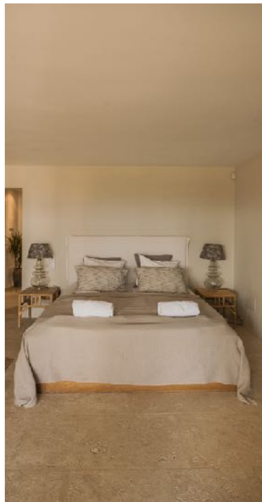
01 The master bedroom on the main floor with en-suite bathroom, sea views, own large lounge terrace and walk-in wardrobe. Egyptian cotton sheets and towels.