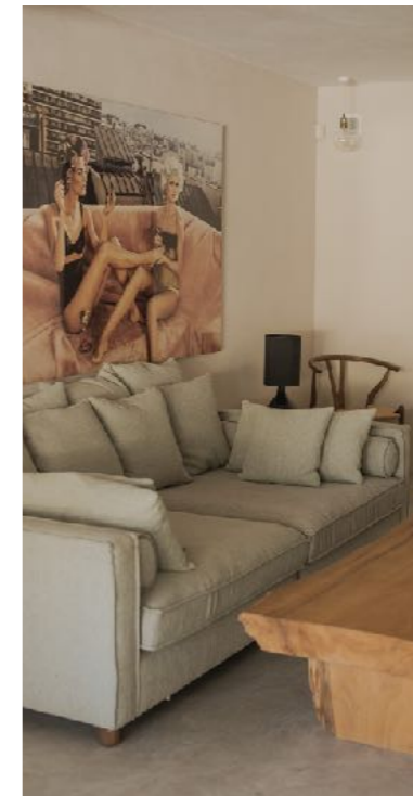
05 TV CINEMA-ROOM

The shaded poolside dining area seats 12 people and has a large gas BBQ.